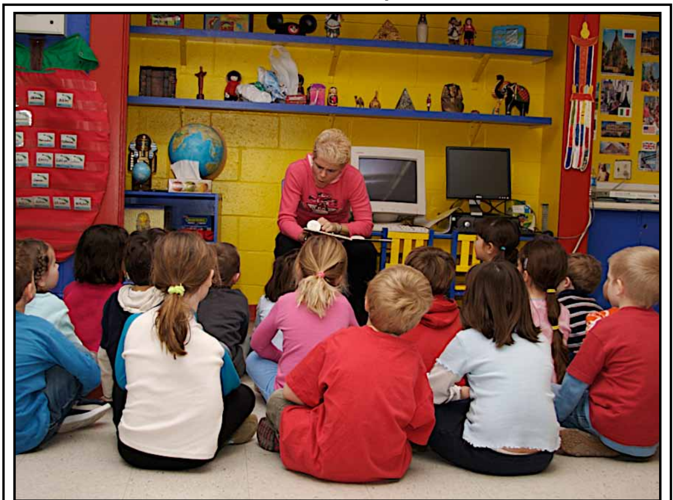
Photographs add colour and life to a story – and a caption adds meaning and context to a photo!

Promoting Wellness in a Safe and Caring Community